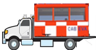
Retouched digital photo

It is necessary to recover Air traffic control capability quickly in case of a damage by Natural disaster, unexpected situation (Fire, Terrorism) etc. under current congested flight schedule and airspace.