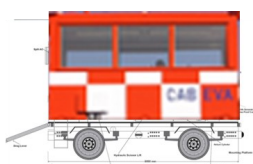
Retouched digital photo