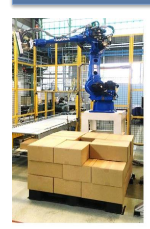
Single load pallet