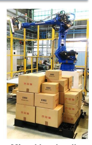
Mixed load pallet