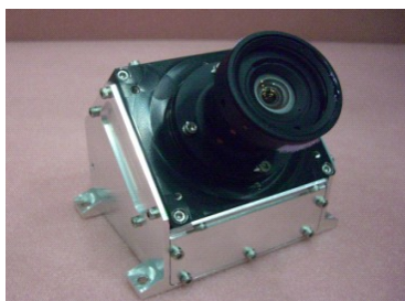
Wide Angle Camera