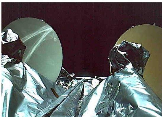
Image: MBA deployment. The antenna system carries two types of antennas for communicating with Japan (left) and other countries (right) respectively.